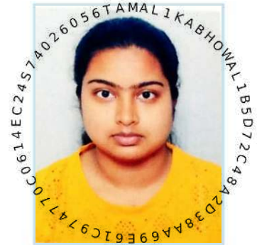
Photo ID Submitted Aadhaar ID (Number : 578373085761)